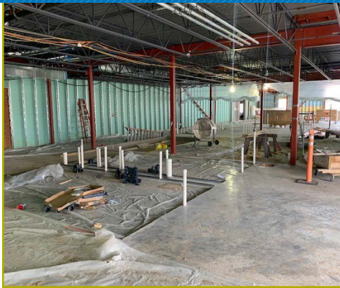
Gearing up to build the bathrooms