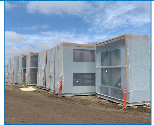
Air Handlers for the Building