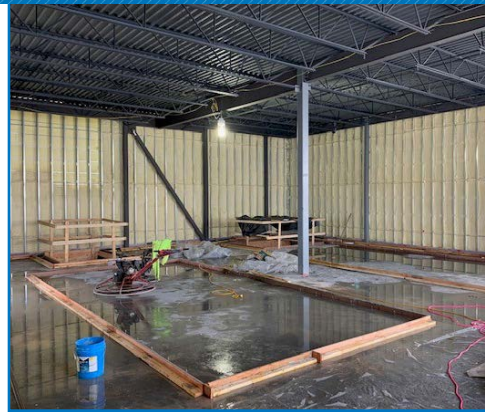
Forming for Air Handler Pads